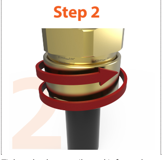
Tighten backnut until a seal is formed onto the cable, then tighten one further turn