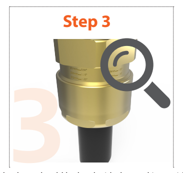
The backnut should be level with the marking guide corresponding to its diameter – this can be visually inspected and adjusted as necessary

Note: The cable gland installation instructions have a printed cable OD measure for if the cable OD is not known