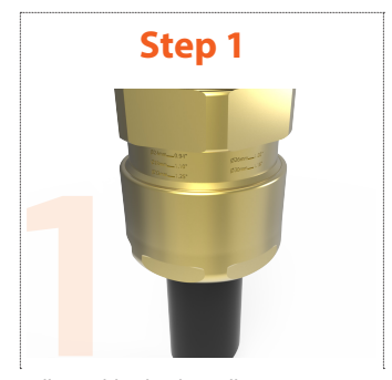
Follow cable gland installation instructions until final stage – tightening of rear seal

The gland is permanently marked with various lines/numbers indicating the correct tightening level related to the cable diameter. Following the relevant cable gland Installation Instructions, the back seal should be tightened until a seal is formed on the cable outer sheath and then tightened one further turn.